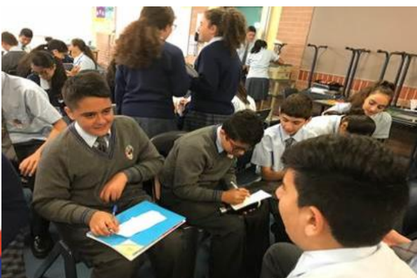
Year 8: Getting along: forming new relationships to build connections and joy.