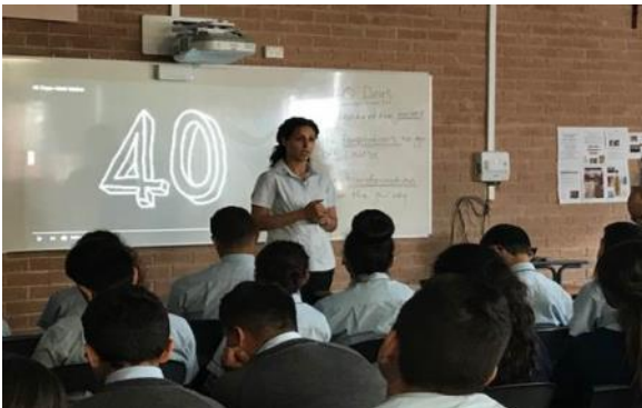
Year 8: Learning to live the season of Lent; to encounter Christ.